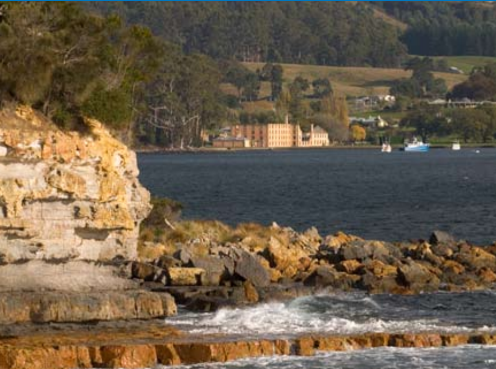
Port Arthur Historic Site

friendly cities. Stay at conveniently located Innkeepers Hotels and Innkeepers Apartments, choosing a style that suits: flexibility to cater for yourself or enjoy restaurant and bar facilities at most properties. The Innkeepers Collection offers a fine tradition of hospitality and quality accommodation.