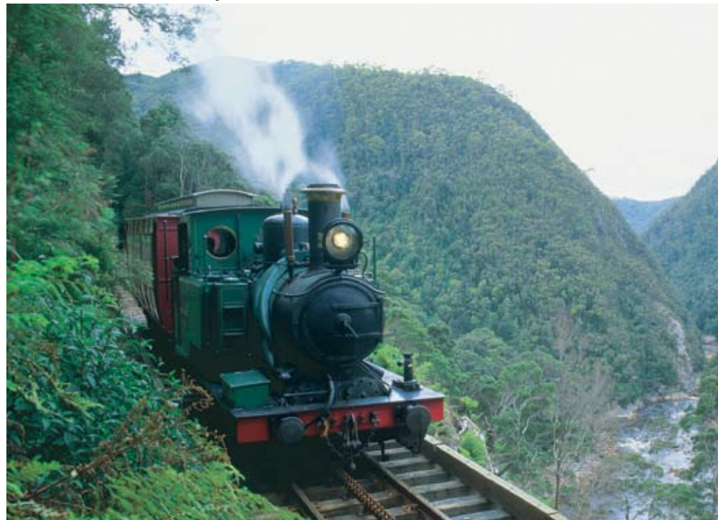
West Coast Wilderness Railway