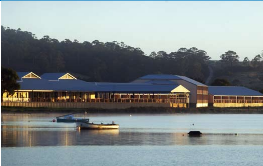
Doherty St Helens Resort

From $270* per person, twin share until 16 Sep 2005;