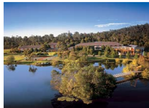
Country Club Resort