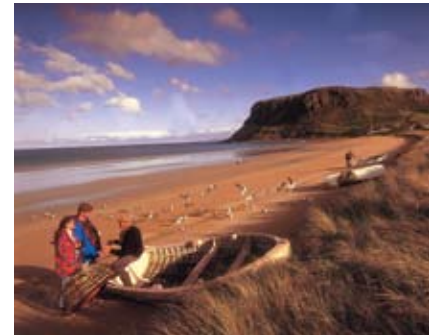
The Nut, Stanley