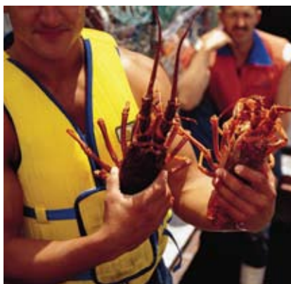
Fresh crayfish from the wharf

Lemonthyme Lodge The Chancellor, near Cradle Mountain, is nestled amongst tall gums and giant ferns. It offers an à la carte award-winning restaurant, wilderness walks, nightly wildlife feeding and trout fishing.