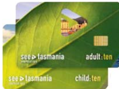
See Tasmania Smartvisit Card